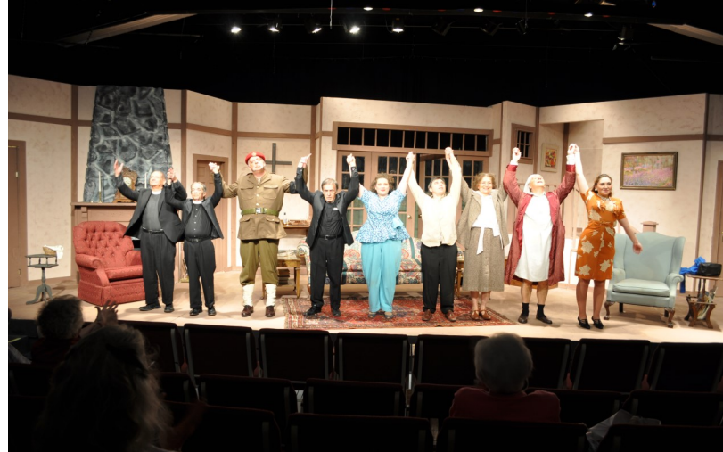
The cast of See How They Run take their final curtain call.

"We are looking for a strong, diverse ensemble, who can also 'represent' the stars of the era."