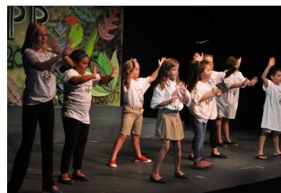
Drama Campers perform for family and friends.

They also gather costume pieces, props and work various technical