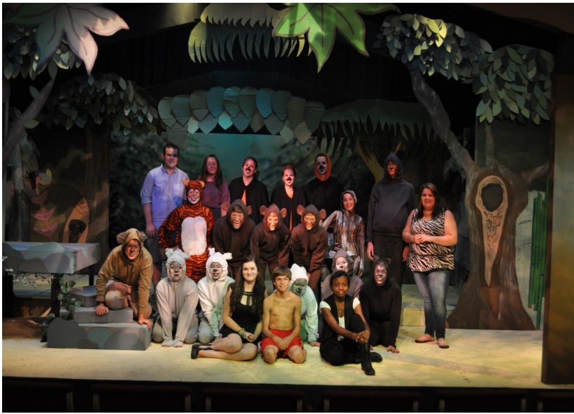
The cast and crew of Possum Juniors' production of "The Jungle Book."